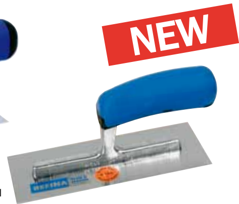
221022 mini trowel