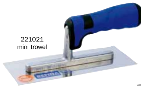
221021 mini trowel