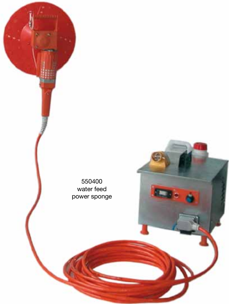
550400 water feed power sponge