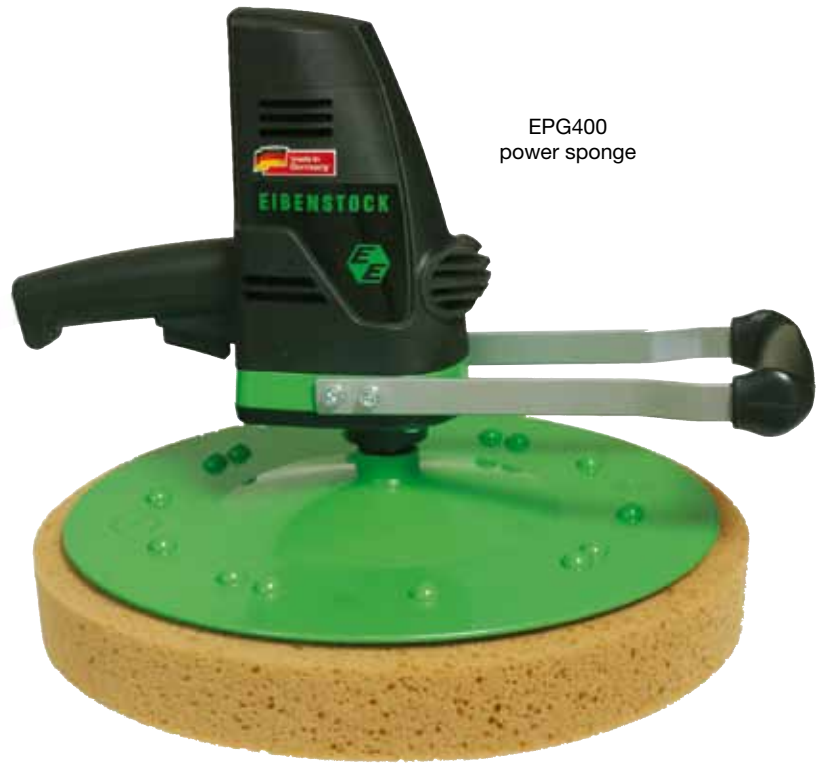
EPG400 power sponge