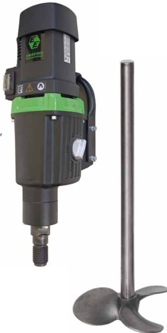
EBM350/3R three speed motor