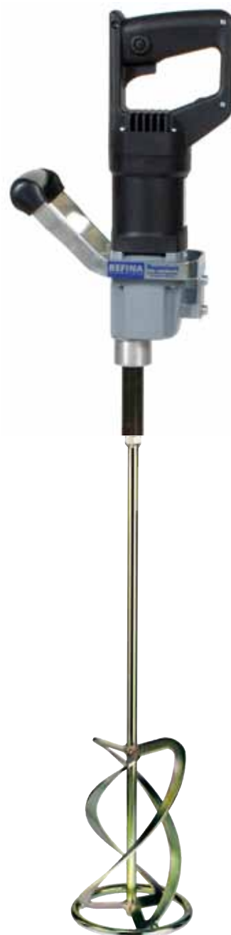
MM19/2 & spiral paddle