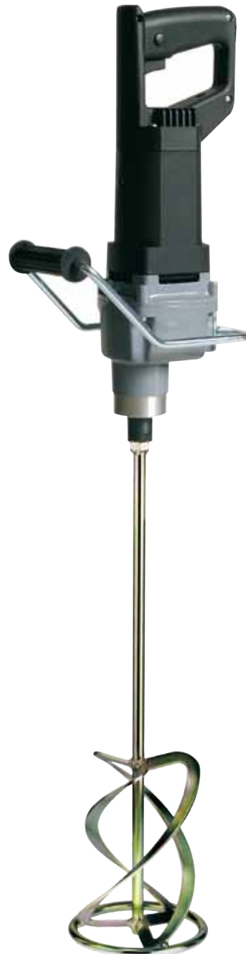
MM29/1 & spiral paddle