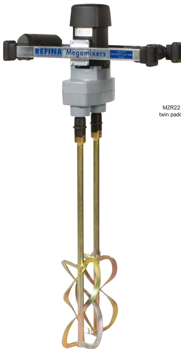
MZR22 & twin paddles