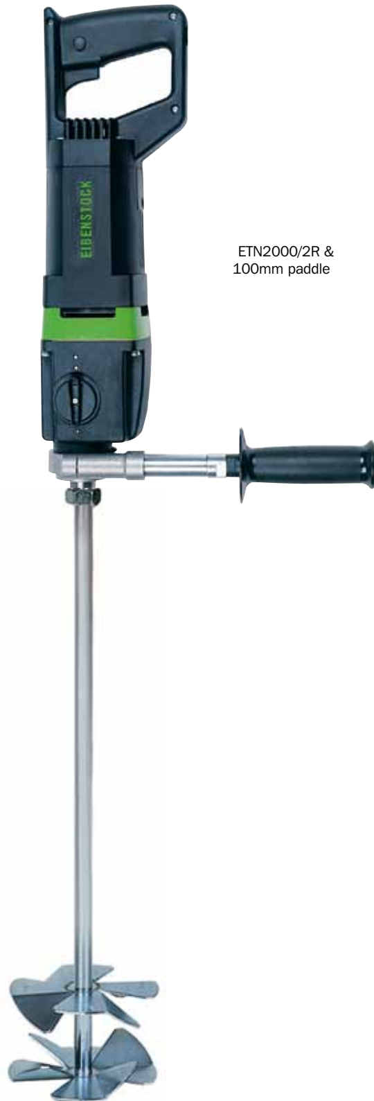
ETN2000/2R & 100mm paddle