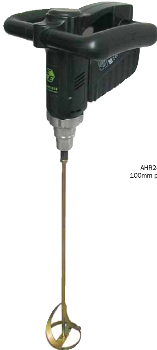
AHR24 & 100mm paddle