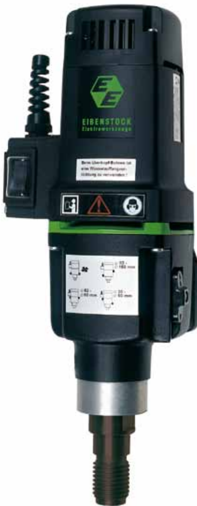
EBM250/2R two speed motor