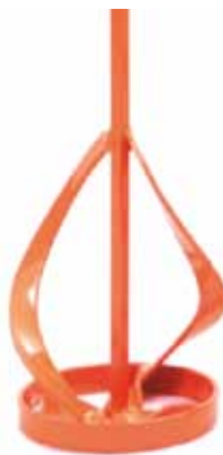
MR2 Spiral Paddle