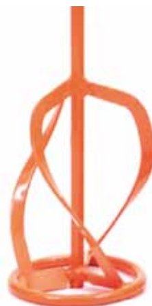
MR3 Spiral Paddle