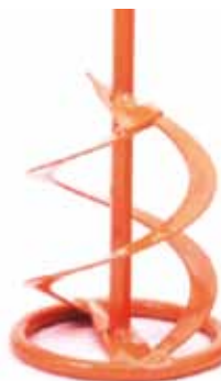
MR4 Screw Spiral Paddle