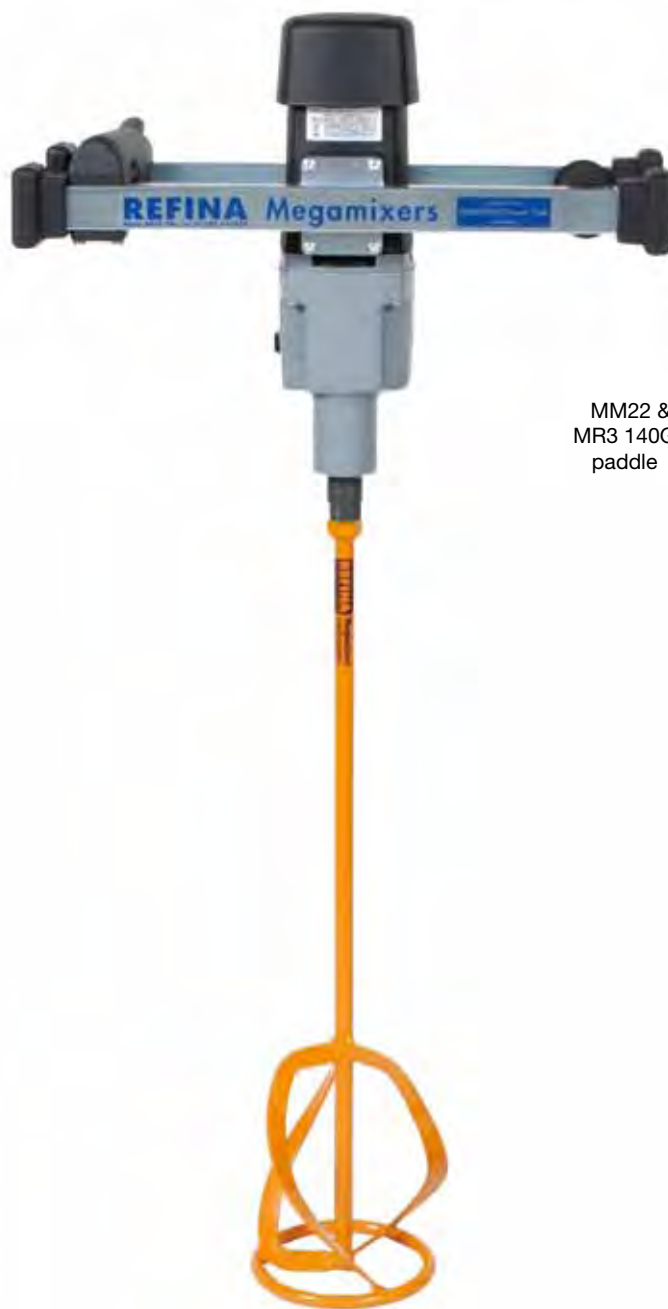
MM22 & MR3 140G paddle