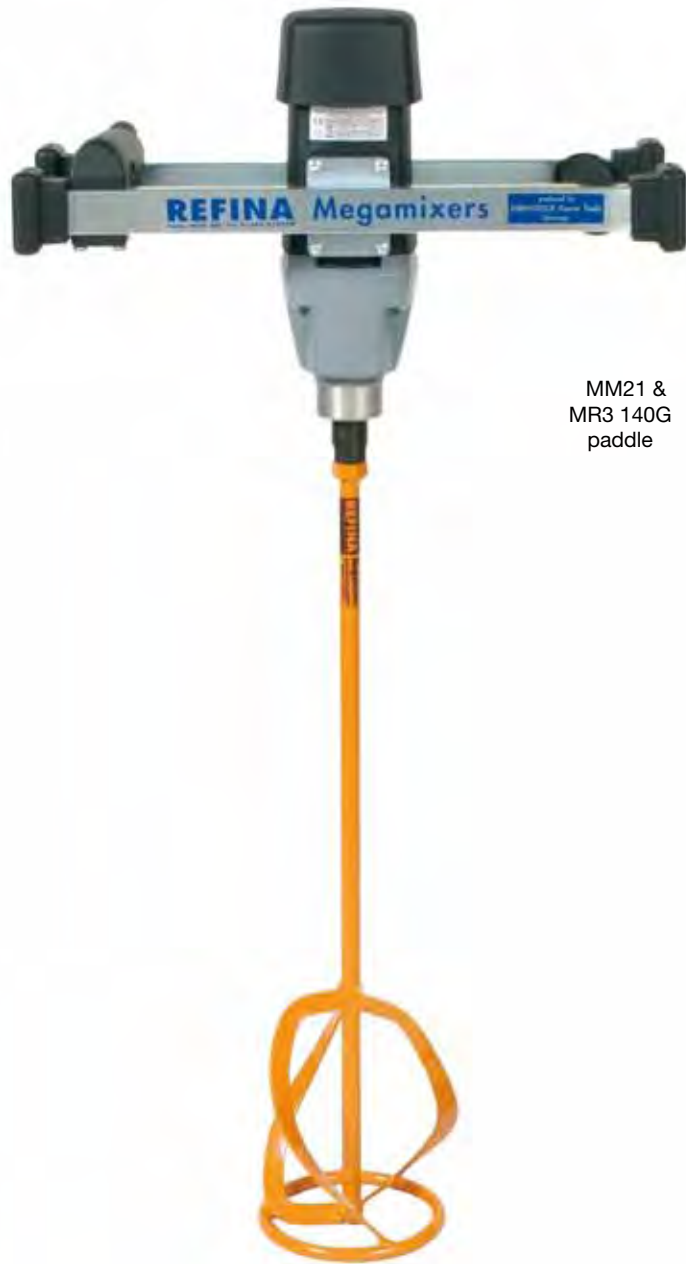
MM21 & MR3 140G paddle