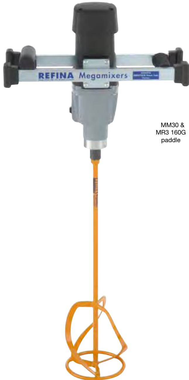
MM30 & MR3 160G paddle