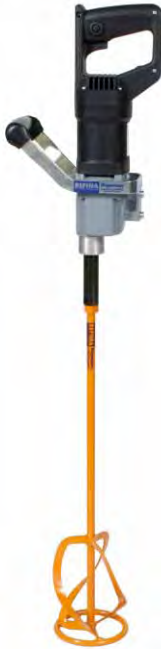
MM19/2 & MR3 130G paddle