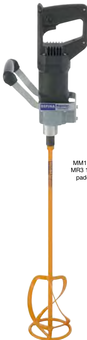
MM19/1 & MR3 130G paddle