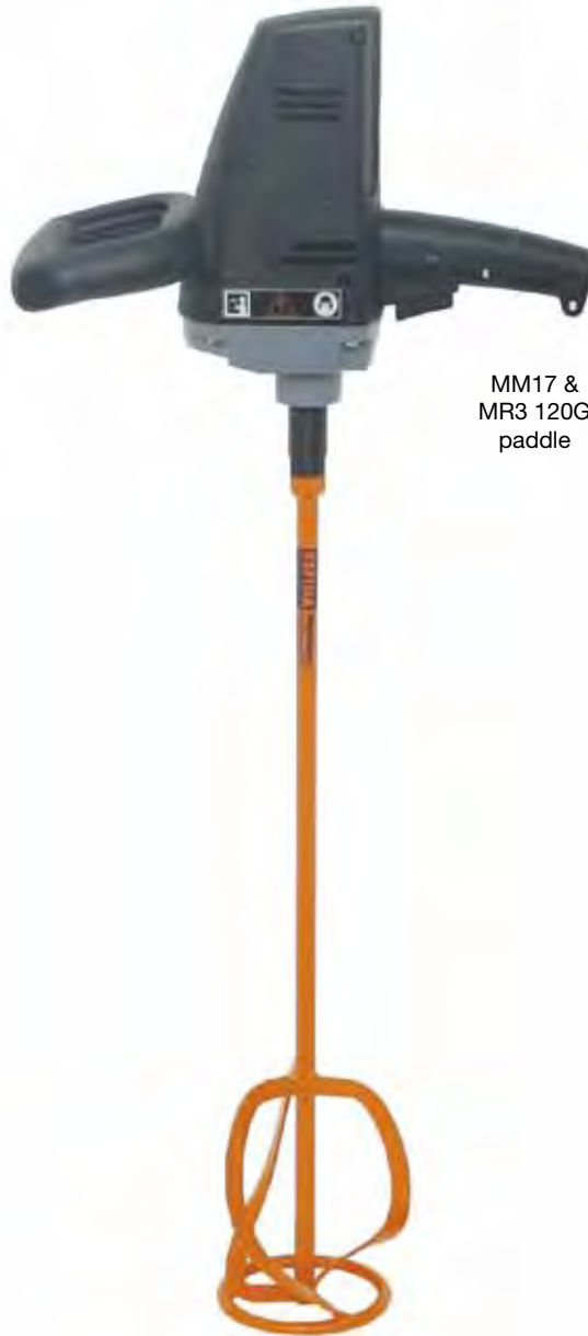
MM17 & MR3 120G paddle