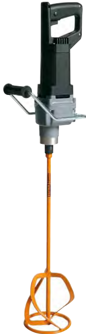
MM29/1 & MR3 160G paddle