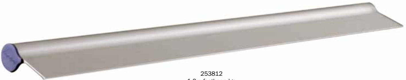
253812 1.2m feather edge