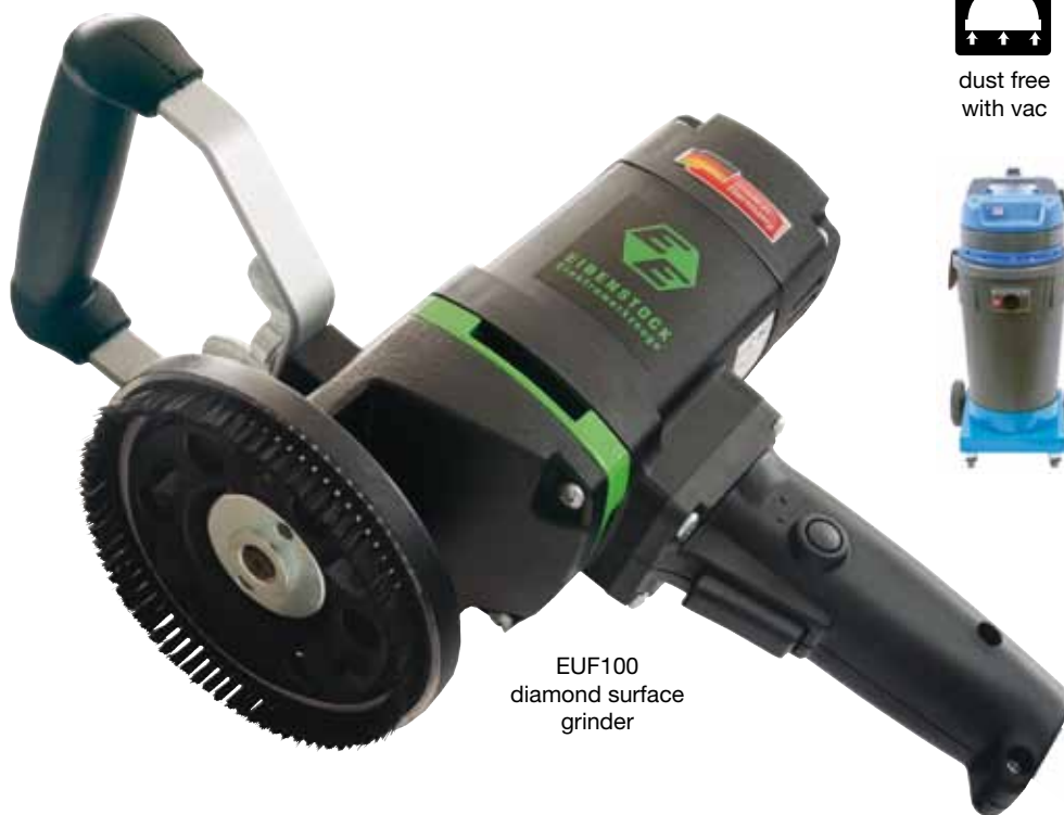
EU100 diamond surface grinder