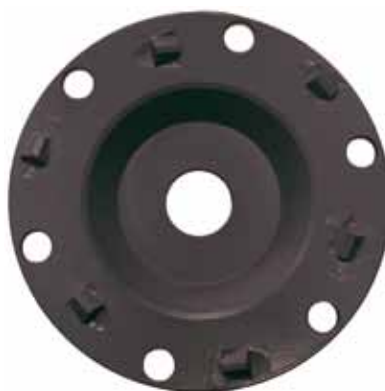
315172 PCD 4" diamond disc