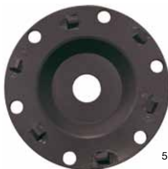
315171 5" PCD diamond disc