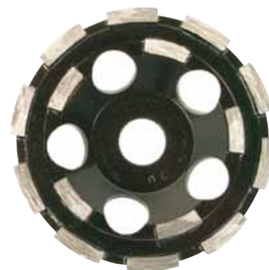
315124 4" diamond disc