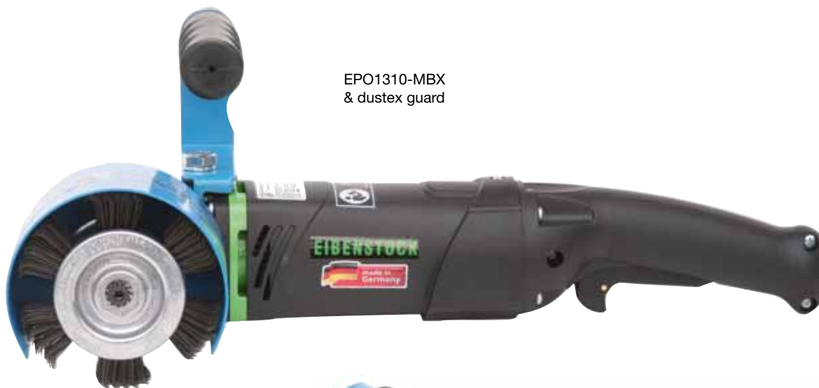
EPO1310-MBX & dustex guard