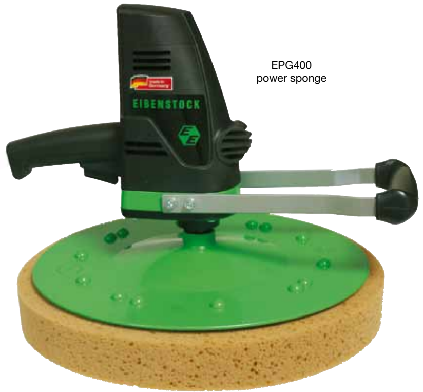
EPG400 power sponge