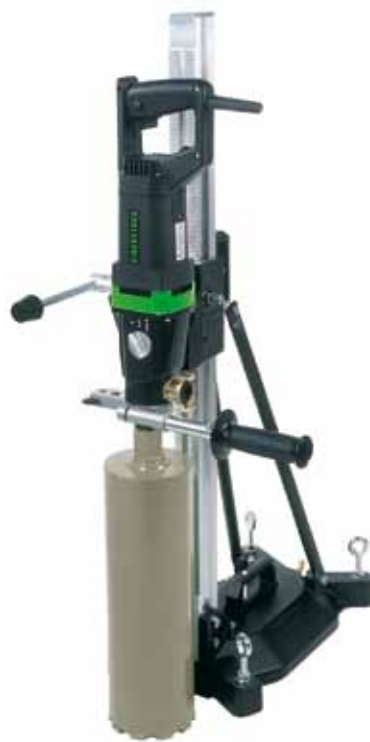
ETN152/3P & BST152 rig