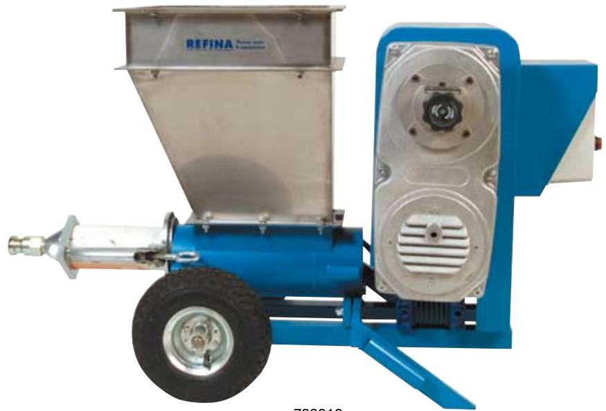
783010 spray pump