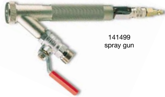
141499 spray gun