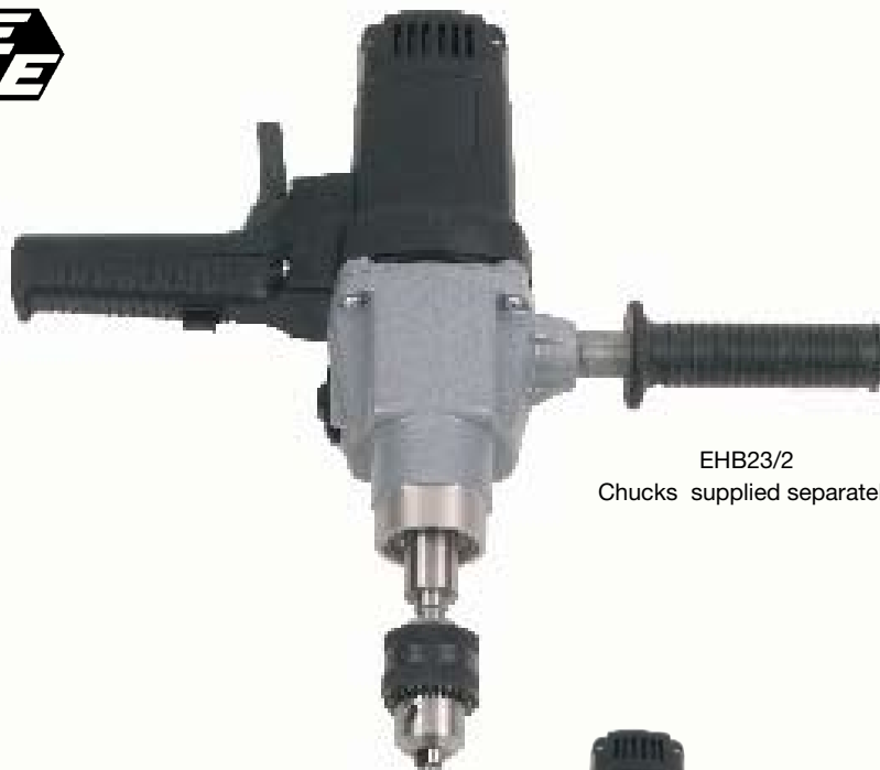
EHB23/2 Chucks supplied separately