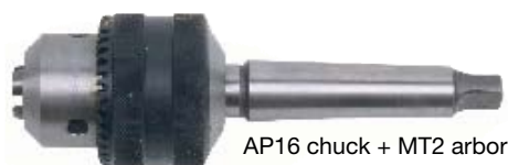
AP16 chuck + MT2 arbor