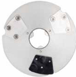
341062 quick change plate