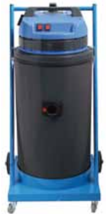
XD302 dustex vac