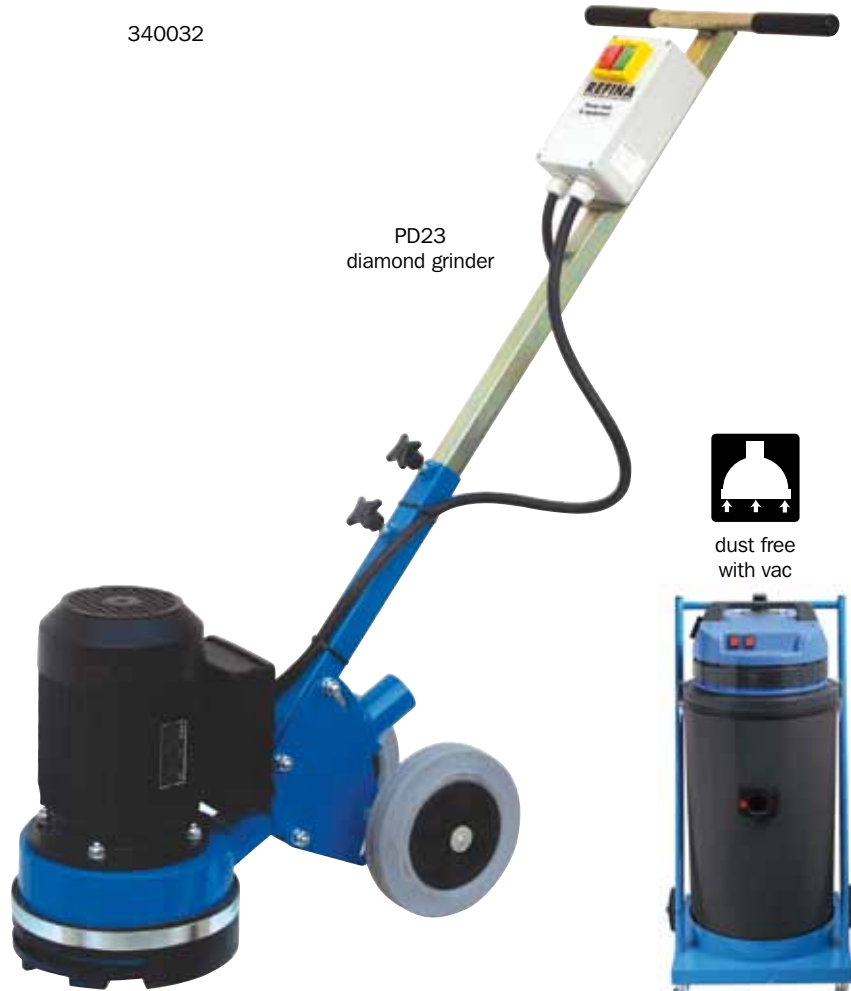
PD23 diamond grinder