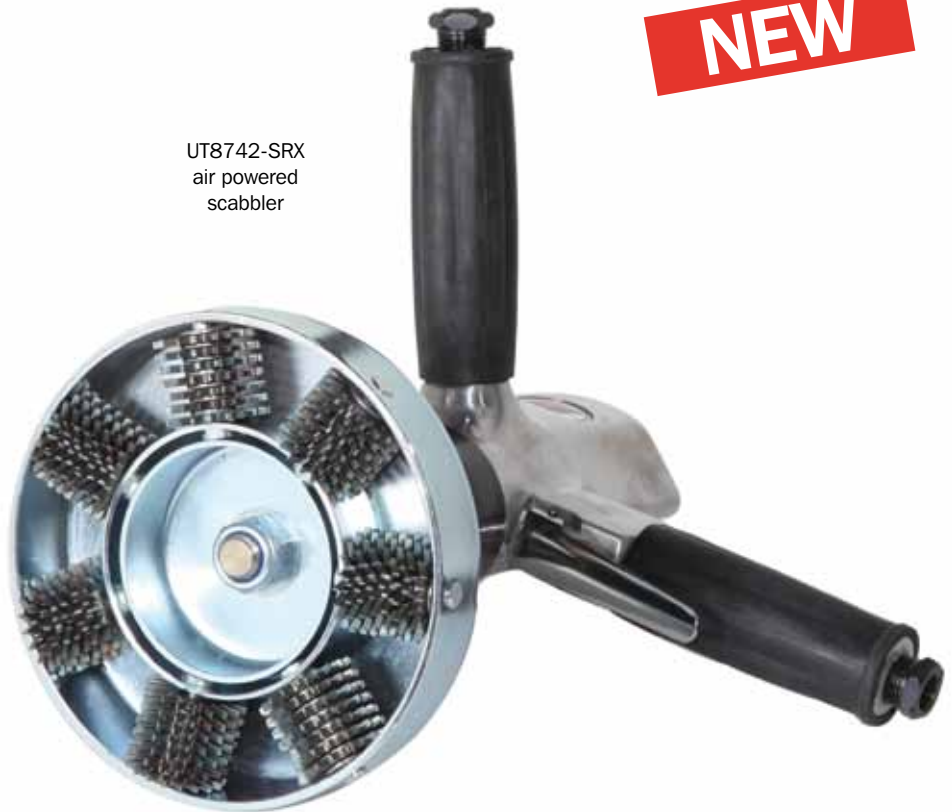
UT8742-SRX air powered scabblers