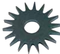
C2 steel cutters