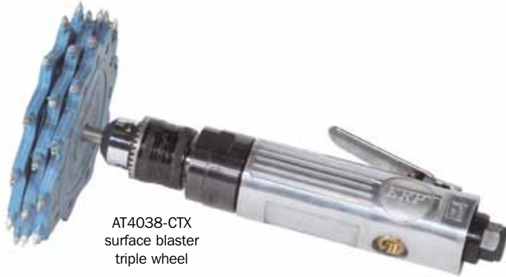
AT4038-CTX surface blaster triple wheel