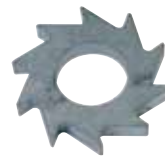
C4 tungsten cutters