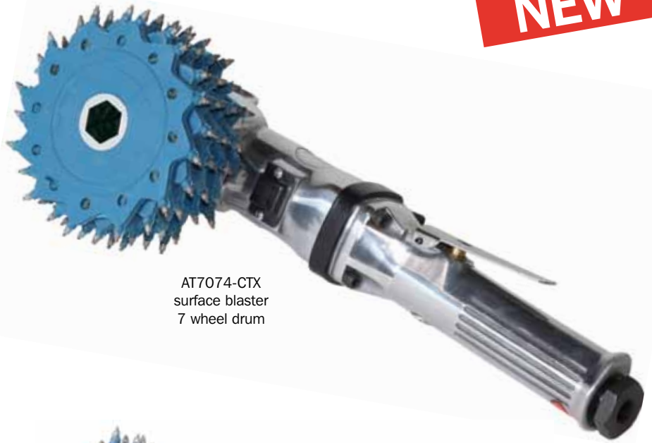
AT7074-CTX surface blaster 7 wheel drum