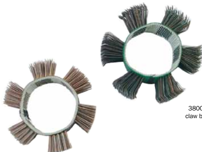
380006 stainless brush